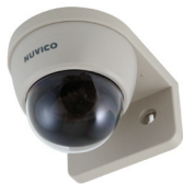
CD-WMI200 (Ivory) Indoor Wall Mount