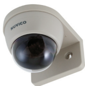
CD-WMI200 (Ivory) Indoor Wall Mount