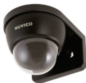
CD-WMB200 (Black) Indoor Wall Mount